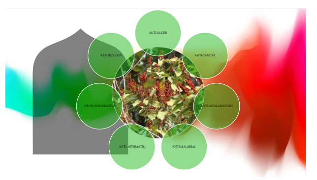
Fig: 2 Pharmacological activities of

Resinous coloured material contains active parts of rottlerin and isorottlerin. It also contains homorottlerin, red role 50%, yellow role 5%, mature 2%, volatile oils, tannin, gum citric acid, and oxalic acids Pharmacological Activities