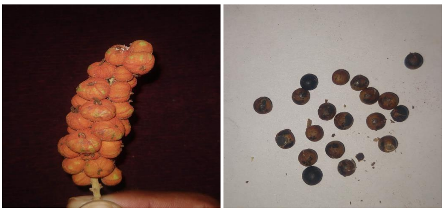
Fig: 1(e) Fig 1: Photographs of (a) Habitat, (b) Habit, (c) Leaves, (d) Flowers, (e) Fruits, (f) Seeds