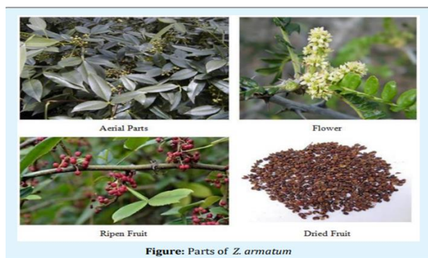
Figure: Parts of Z. armatum