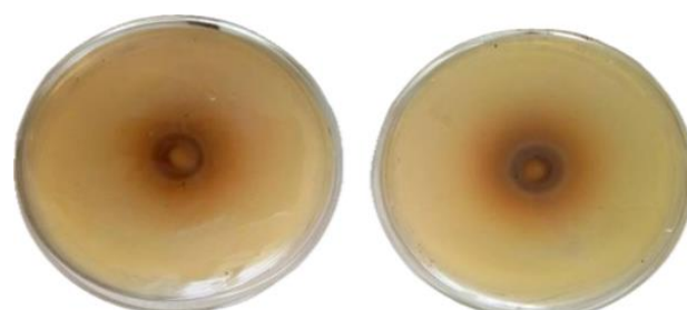
Zone of inhibition of lactobacillus from potassium ether extract (Z. armatum)

The chloroform, pet.ether, and water extract was prepared by using the Soxhlet apparatus of zanthoxylum armatum to study its antibacterial potential. Antibacterial analysis of extract was carried out against lacto-bacillus organisms. The zone of inhibition in mm for the tested organism with the Chloroform, pet.ether and water extract of Zanthoxylum armatum and by agar well diffusion method. In the present study, Chloroform, pet.ether, and water, stem extract Zanthoxylum armatum obtained by Soxhlet extraction was screened to detect the presence or absence of several bioactive compounds which are reported to cure different diseases. Anti-microbial analysis of stem extract was carried out against lacto-bacillus organisms by agar well diffusion method. It was observed that the zone of inhibition was recorded against lacto-bacillus organisms. The results indicate that the chloroform, pet.ether and water extract of Zanthoxylum armatum is having anti-bacterial efficiency in controlling the bacteria.