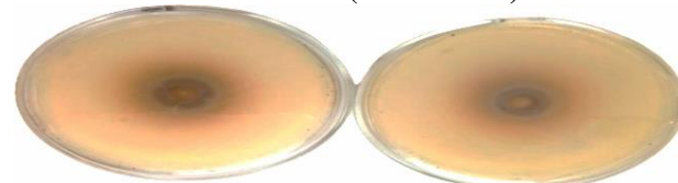
Zone of inhibition from chloroform extract (Z. armatum)