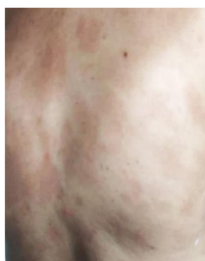
Fig 1.3 Day 2