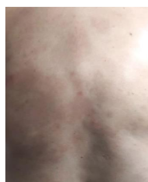
Fig 1.4 Day 4