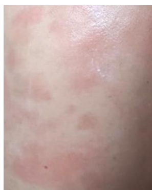
Fig 1.2 Day 1