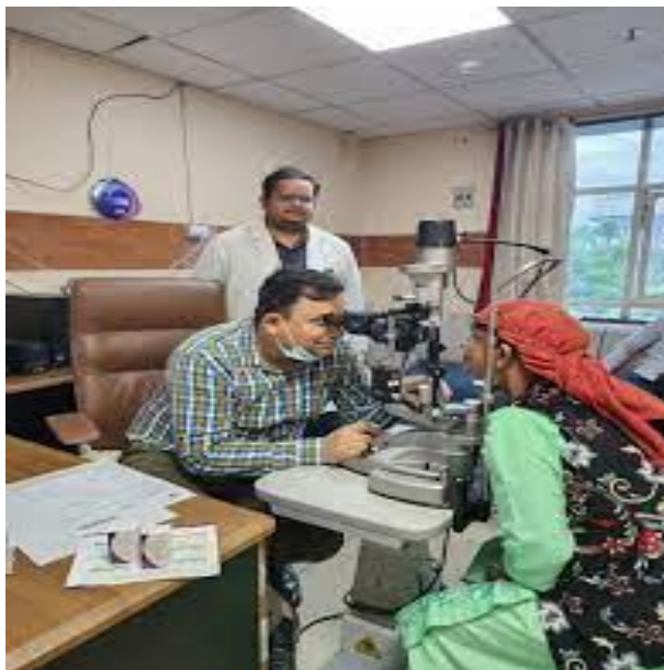
Figure: 1 (a) Govt doon medical College (b) Department of Ophthalmology check patients