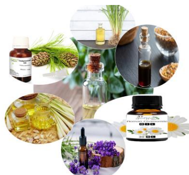
Figure 1: Extraction of essential oil from different Plant Chemistry of Essential oil

We search through a variety of sources such as PubMed, Publon, and the Web of Sciences. The titles and abstracts of the articles were reviewed. This review does not include any items that are not about lemon essential oils, lavender essential oils, eucalyptus essential oils, clove essential oils, or cinnamon essential oils. Studies that were related to a number of other EOs were not considered. For the purpose of this review, a total of twenty papers that were deemed relevant were chosen.